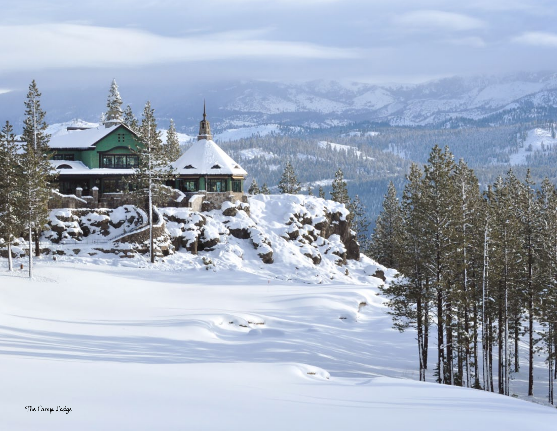
The Camp Lodge