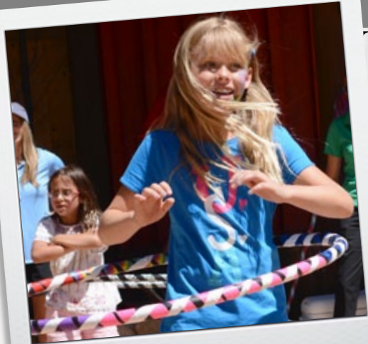
Hoopling it up