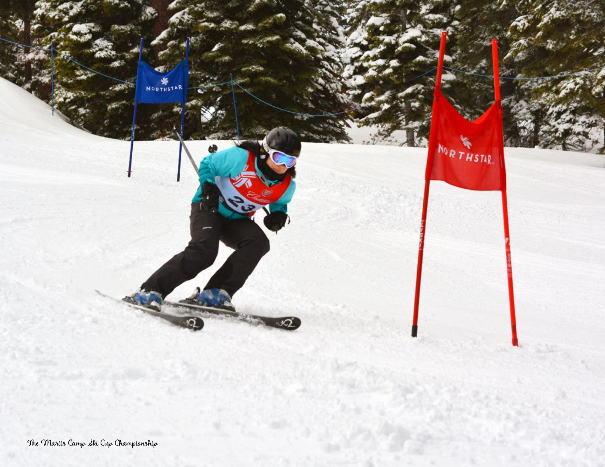
The Martis Camp Ski Cup Championship