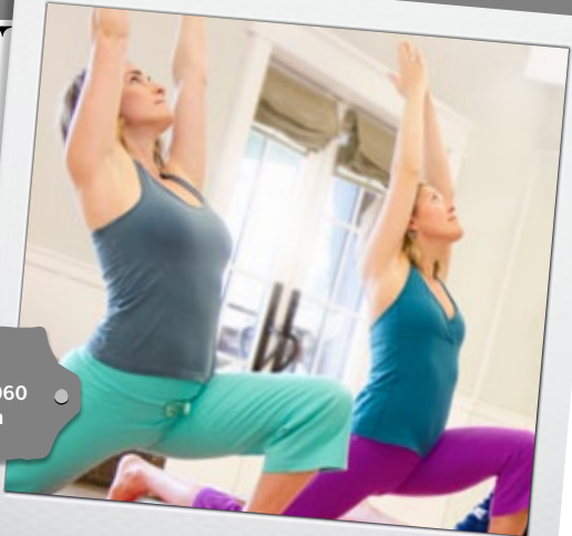
Yoga in the Fitness Studio