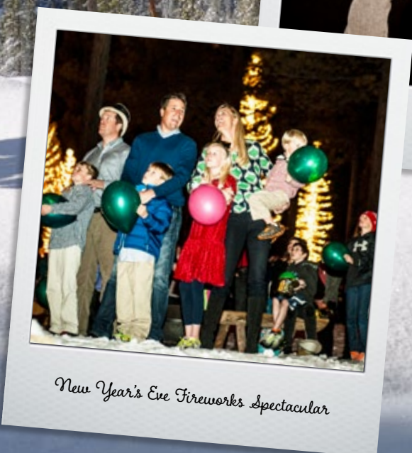
New Year's Eve Fireworks Spectacular