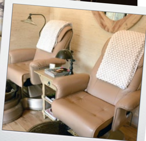
Pedi at the Spa