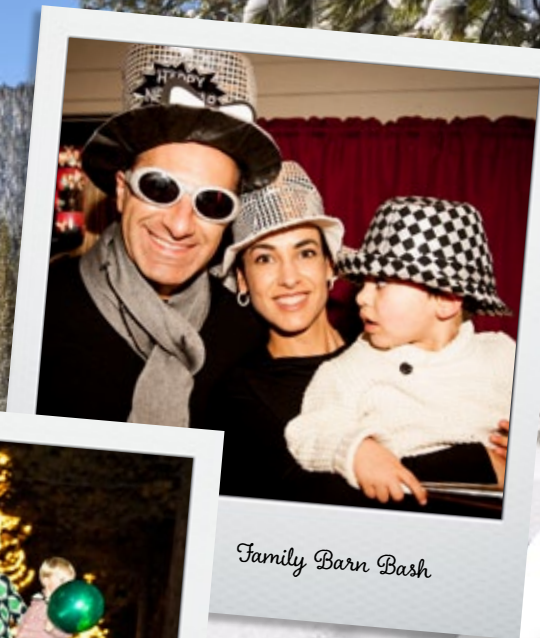
Family Barn Bash