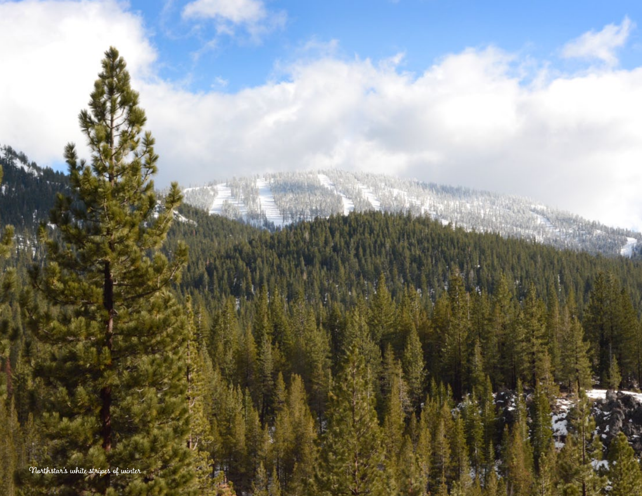
Northstar's white stripes of winter