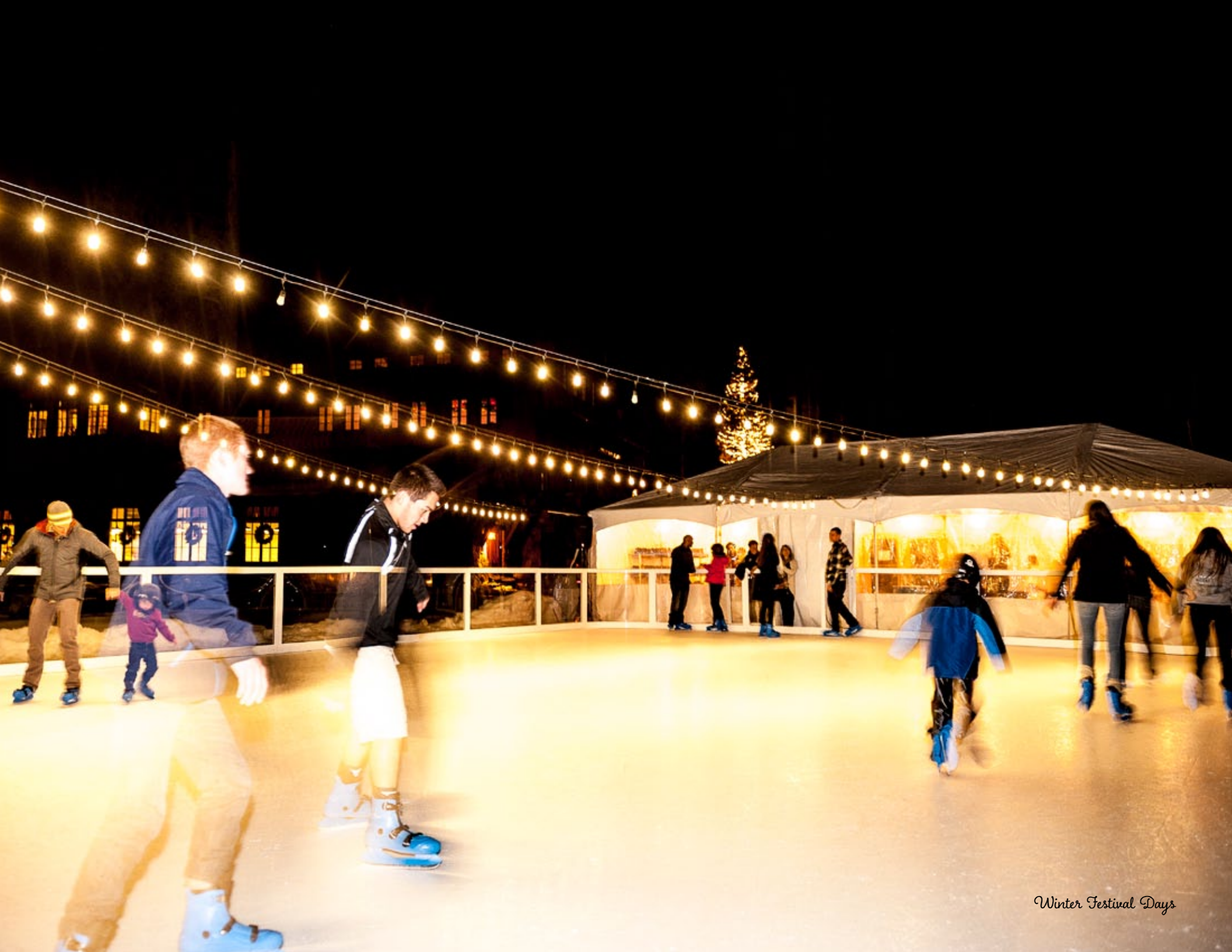
Winter Festival Days