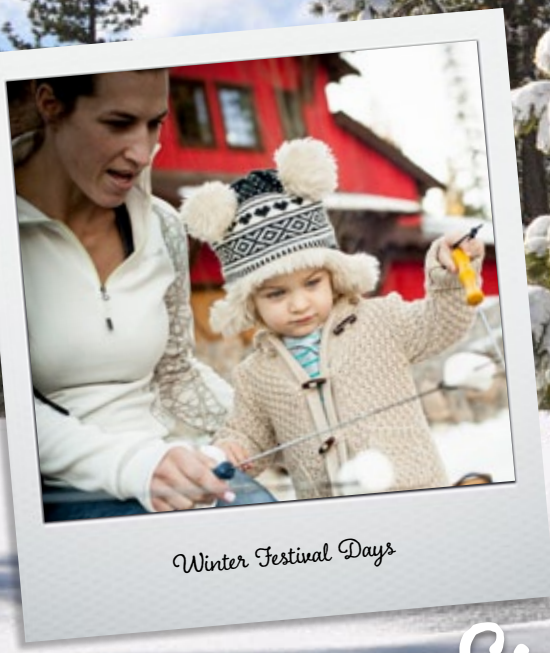
Winter Festival Days