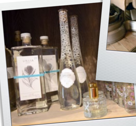
Beauty products at the shop