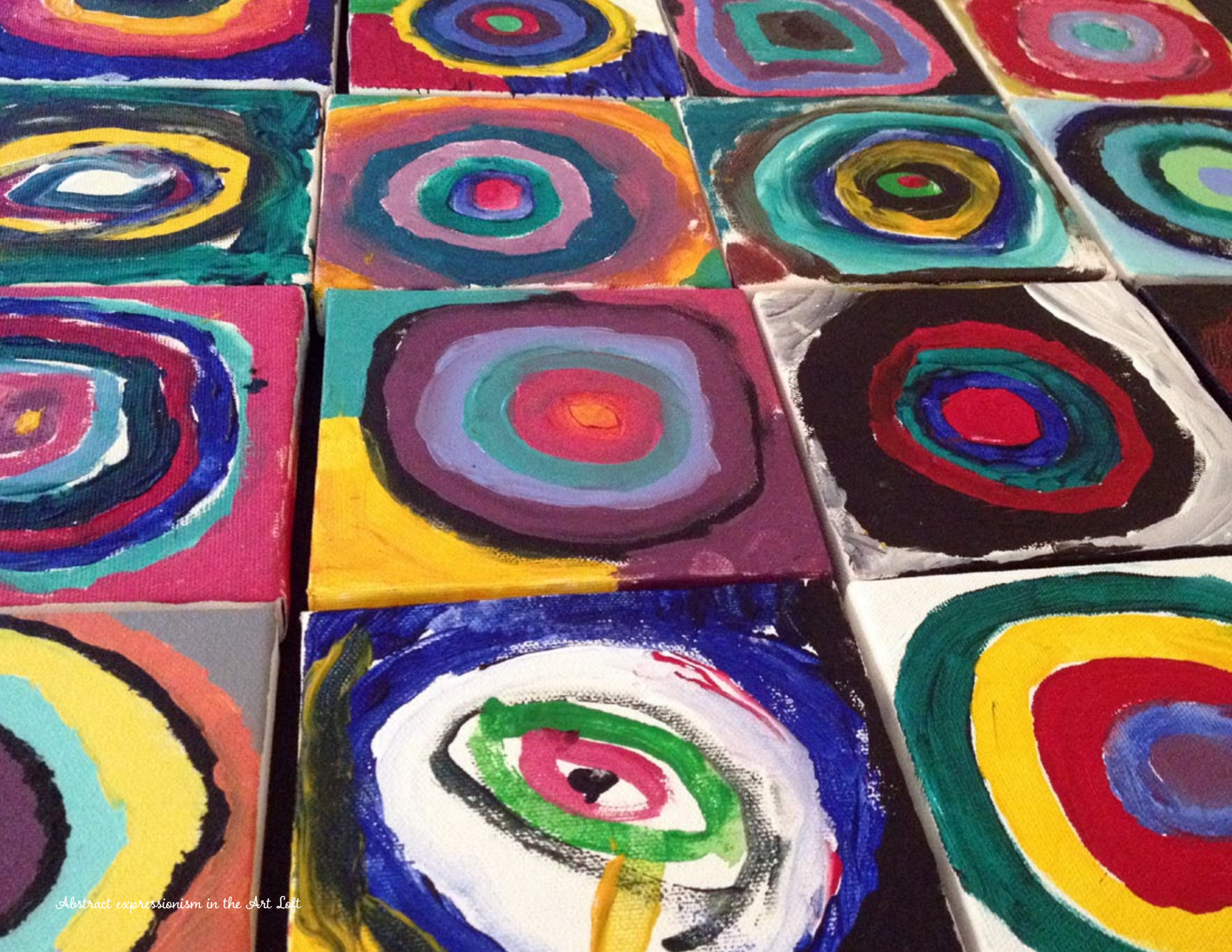
Abstract expressionism in the Art Loft