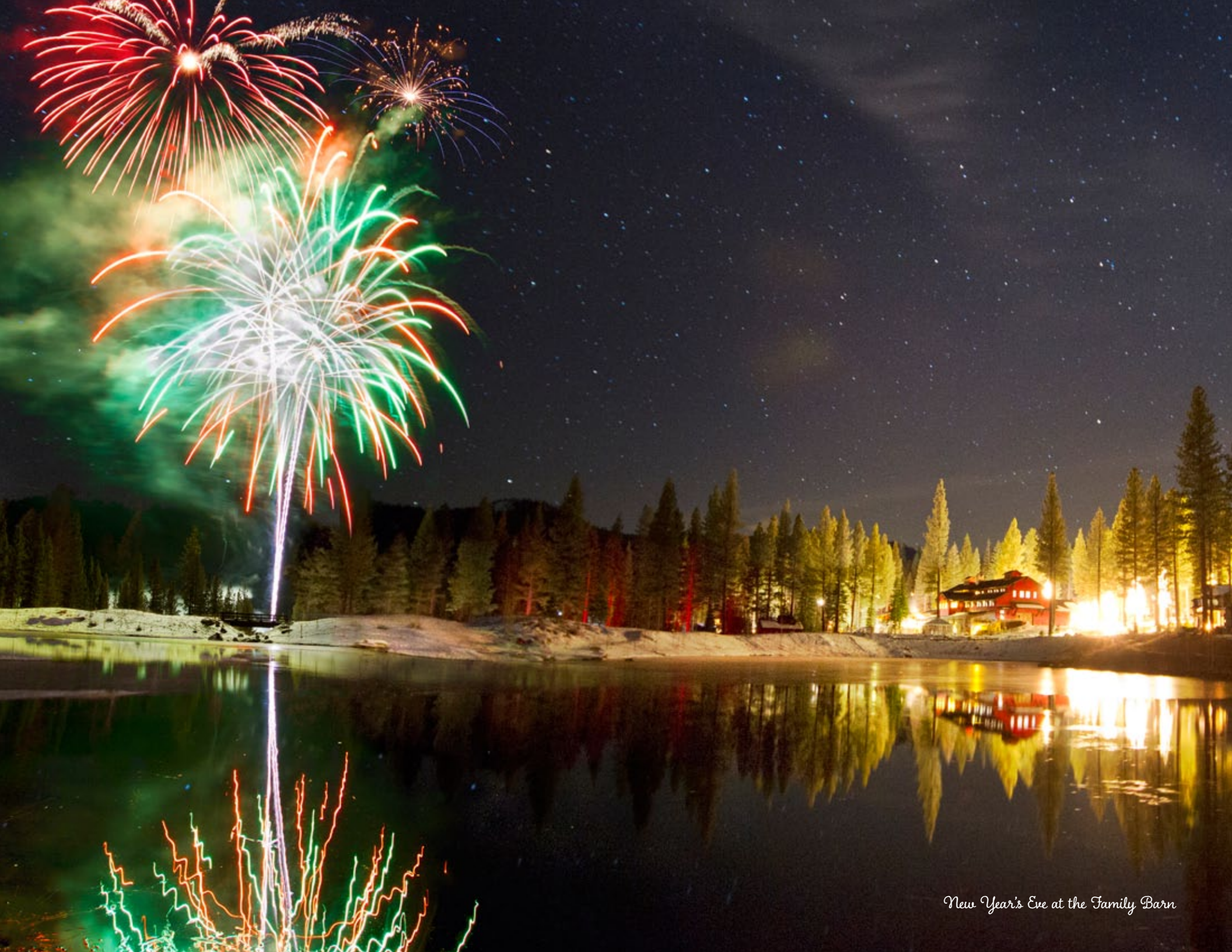
New Year's Eve at the Family Barn