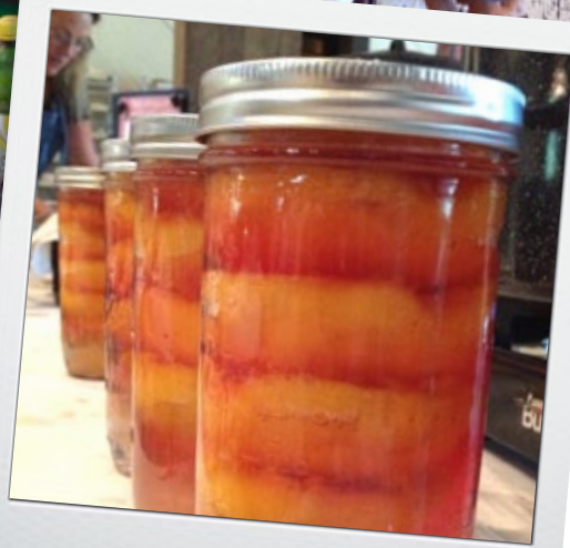
Gifts of Taste with SunMie Won