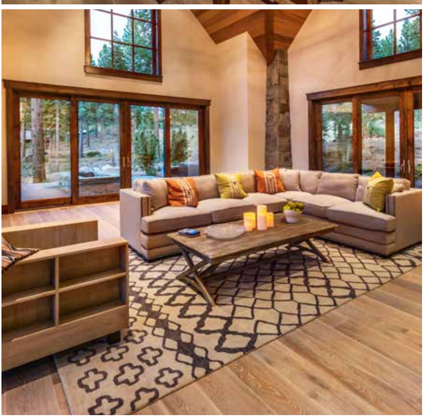
Information herein deemed reliable but not guaranteed and should be verified.