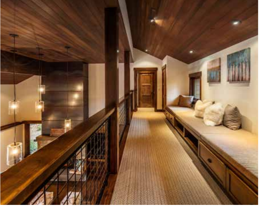
Information herein deemed reliable but not guaranteed and should be verified.