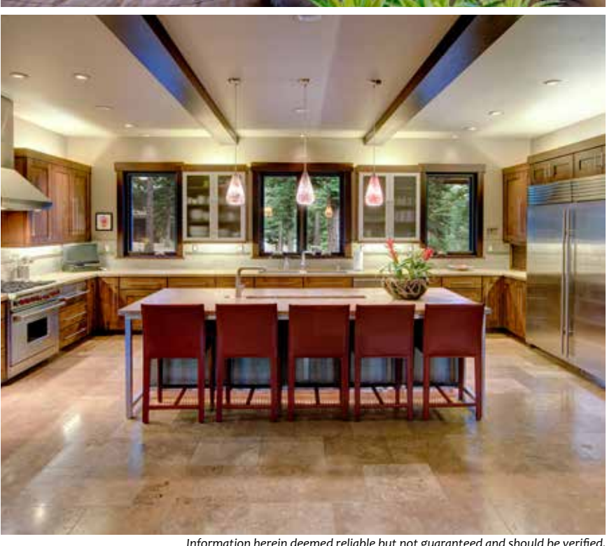
Information herein deemed reliable but not guaranteed and should be verified.