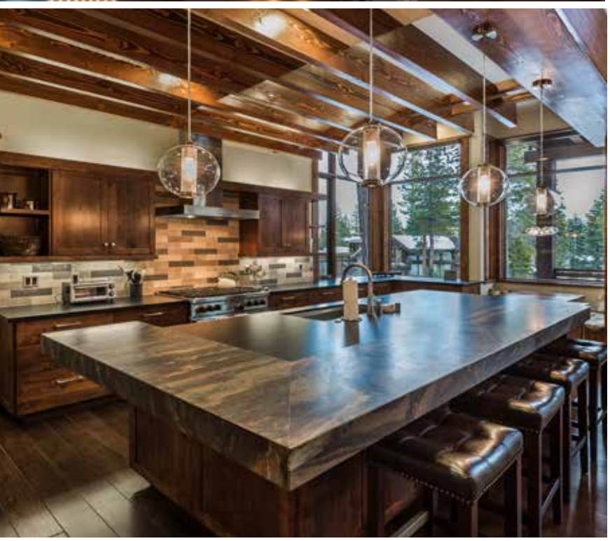
Information herein deemed reliable but not guaranteed and should be verified.