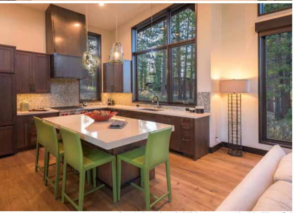
Information herein deemed reliable but not guaranteed and should be verified.