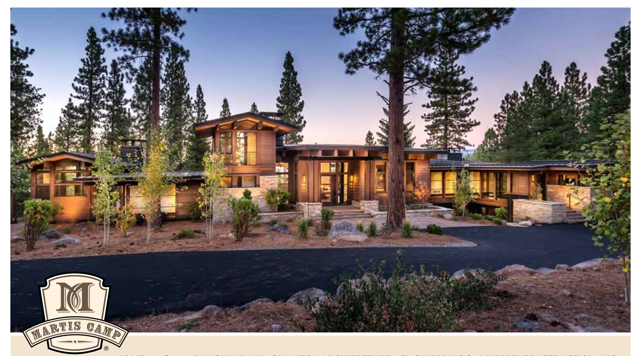
REALTY HOME 472 / 9500 DUNSMUIR WAY / WALTON ARCHITECTURE + ENGINEERING / LAMPERTI CONSTRUCTION, INC.