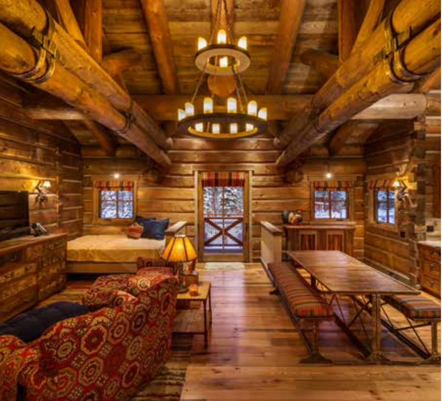
Information herein deemed reliable but not guaranteed and should be verified.