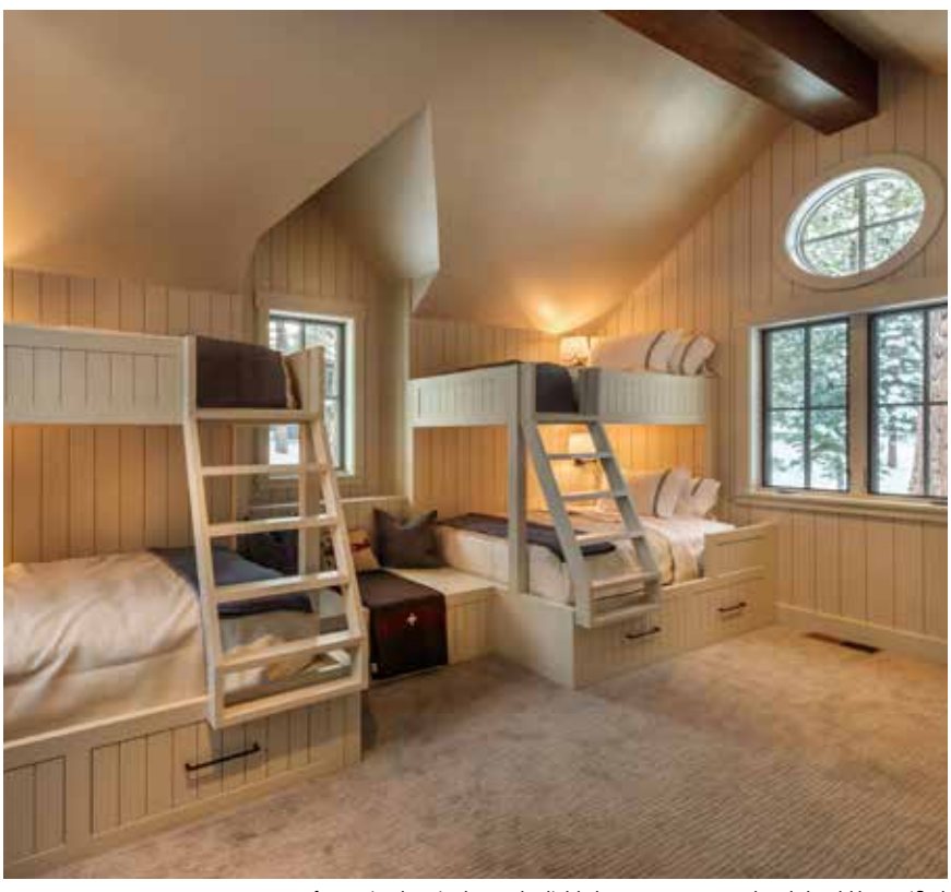
Information herein deemed reliable but not guaranteed and should be verified.