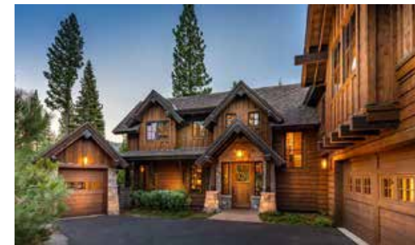
Home 363 - $3,795,000 3,245 Sq Ft / 4 Bedroom - 4.5 Baths Dennis Zirbel Architect / NSM Construction