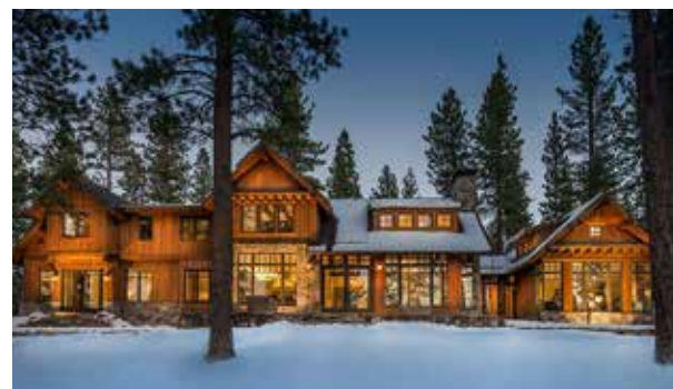
Home 408 - $5,695,000 4,404 Sq Ft / 5 Bedrooms - 4.5 Baths Swaback Partners / NSM Construction