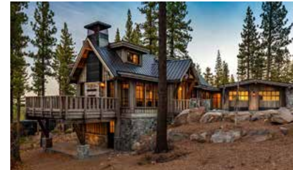
Home 515 - $4,295,000 3,500 Sq Ft / 4 Bedrooms - 4.5 Baths Sandbox Studio / Structerra