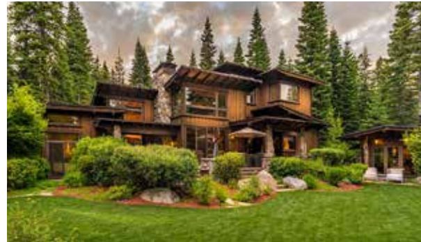
Home 27 - $4,125,000 3,415 Sq Ft / 5 Bedrooms - 4.5 Baths Mountain Concepts / Paul Bunke