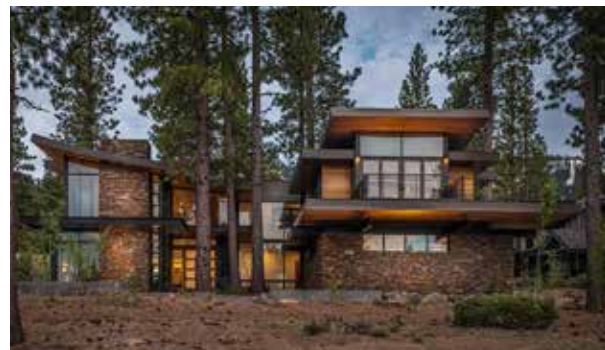
Home 468 - $4,895,000 4,136 Sq Ft / 5 Bedroom - 5.5 Baths Fred Lattanzio / Josh Ruppert Construction