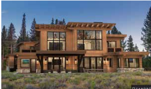
Home 233 - $4,150,000 3,250 Sq Ft / 4 Bedrooms - 4.5 Baths Sandbox Studio / Fraiman Construction