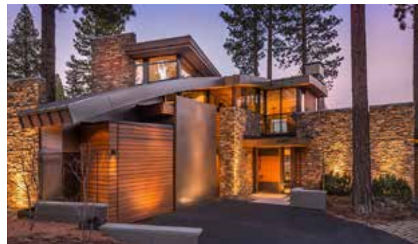
Home 300 - $4,695,000 - PENDING 3,249 Sq Ft / 3 Bedroom - 3.5 Baths JLS Design / Jones Corda Construction