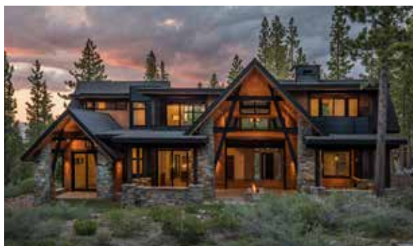
Home 585 - $5,695,000 5,307 Sq Ft / 5 Bedrooms - 5+2 Half Baths Mountain Concepts / Rinnovo Group