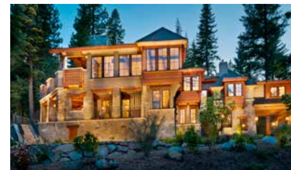
Home 29 - $6,595,000 8,227 Sq Ft / 5 Bedrooms - 5 plus 2 Half Baths MWA Architects / Sunco Homes