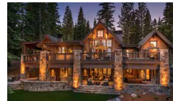
Home 37 - $6,895,000 6,794 Sq Ft / 6 Bedrooms - 5.5 Baths Lot C Architecture / A.P. Thomas Construction

Access to and use of the recreational amenities are not included in the purchase of homesites and require separate club membership. Obtain and carefully review the offering circular for Martis Camp Club before making any decision to purchase a club membership. Information deemed reliable but not guaranteed and should be verified. Martis Camp Realty, Inc. a CA Broker DRE license # 01997809