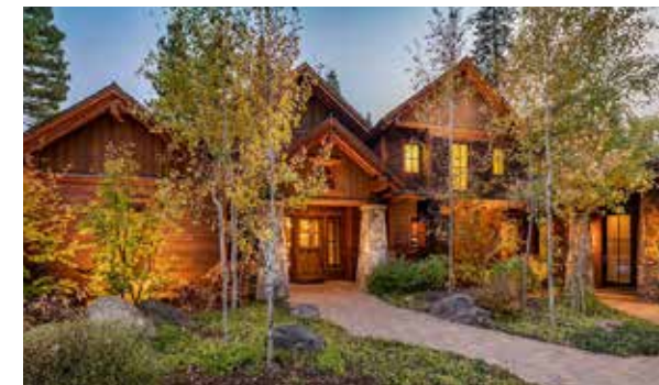
Home 3 - $5,495,000 5,103 Sq Ft / 5 Bedrooms - 6.5 Baths Dennis E. Zirbel, Architect / MT Development