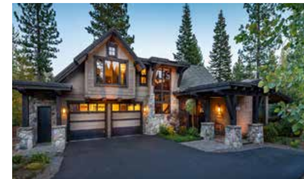
Home 364 - $3,850,000 3,250 Sq Ft / 4 Bedrooms - 5 Baths Nick Sonder Deisgn / Robert Marr Construction