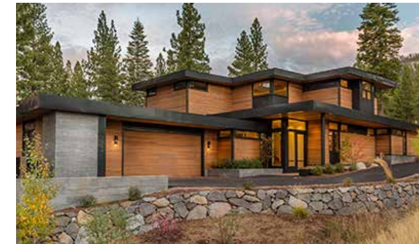
Home 455 - $5,495,000 4,496 Sq Ft / 4 Bedrooms - 4.5 Baths Ryan Group Architects / Vineyard Custom Homes