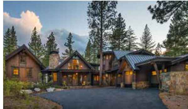
Home 432 - $3,995,000 4,047 Sq Ft / 4 Bedrooms - 3.5 Baths Sandbox Studio / Tanner Construction