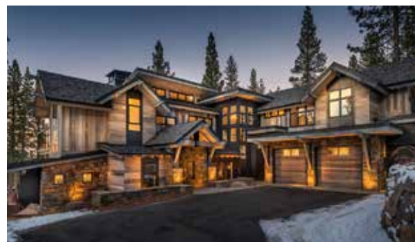
Home 670 - $5,495,000 4,500 Sq Ft / 5 Bedrooms - 5.5 Baths Kelly Stone Architects / Vineyard Custom Homes