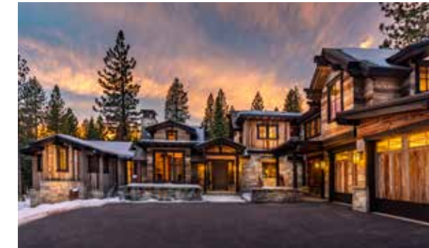
Home 81 - $4,395,000 3,712 Sq Ft / 4 Bedrooms - 3.5 Baths Sandbox Studio / Lamperti Construction