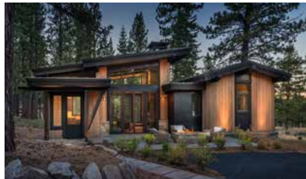
Home 424 - $2,395,000 1,101 Sq Ft / 2 Bedrooms - 2 Baths Sandbox Studio / Tanner Construction