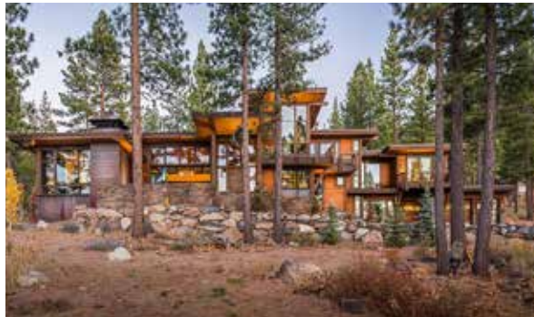
Home 507 - $4,895,000 - PENDING 4,155 Sq Ft / 5 Bedroom - 5.5 Baths Walton Architecture / Vineyard Custom Homes