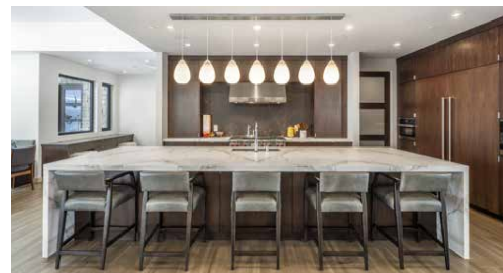
MARTIS CAMP HOME 650 • $13,795,000 • 7,180 SQ.FT. • 6 BEDROOMS • 6+3 BATHROOMS

Access to and use of the recreational amenities are not included in the purchase of homesites and require separate club membership. Obtain and carefully review the offering circular for Martis Camp Club before making any decision to purchase a club membership. No guarantee is made to Buyer that a Martis Camp Club membership will be available to Buyer or that Buyer will be approved for a membership through the Martis Camp Club unless the club issues a formal approval letter to Buyer. Martis Camp Club is the sole transfer agent for memberships and all dues, initiation fees and assessments are set by the Club. Information deemed reliable but not guaranteed and should be verified. Martis Camp Realty DRE License #01997809