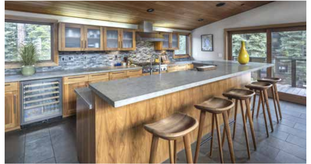
MARTIS CAMP HOME 246 • $5,495,000 • 3,250 SQ.FT. • 5 BEDROOMS • 4.5 BATHROOMS