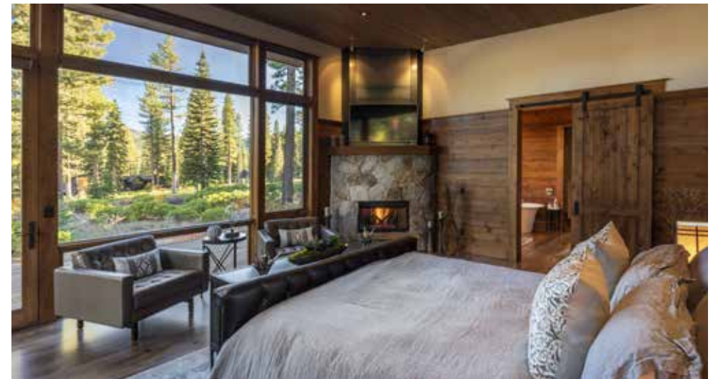
MARTIS CAMP HOME 107 • $9,995,000 • 4,782 SQ.FT. • 5 BEDROOMS • 5.5 BATHROOMS