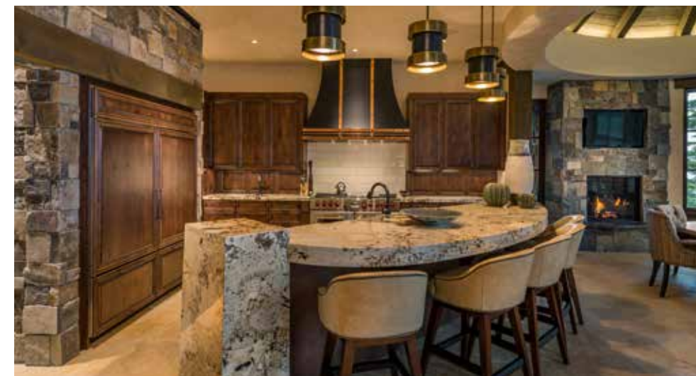
MARTIS CAMP HOME 41 • $25,000,000 • 10,000 SQ.FT. • 7 BEDROOMS • 8+2 BATHROOMS