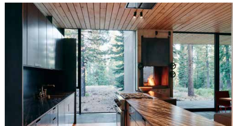
MARTIS CAMP HOME 140 • $13,500,000 • 5,794 SQ.FT. • 4 BEDROOMS • 4.5 BATHROOMS