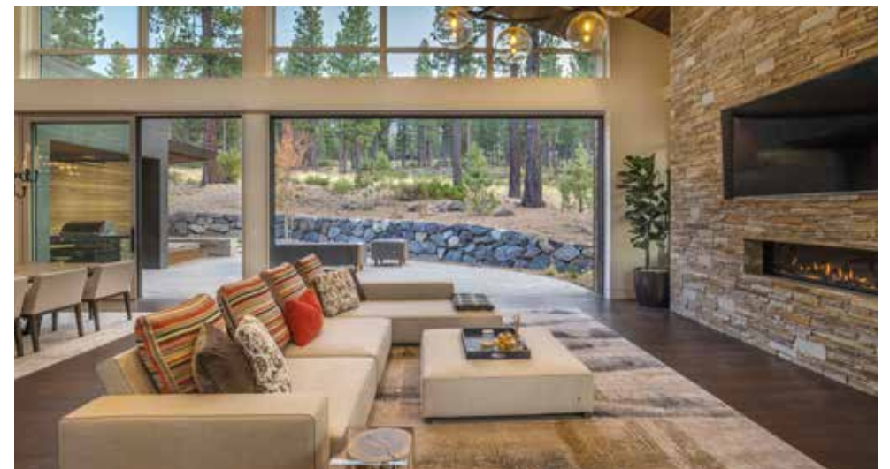
MARTIS CAMP HOME 673 • $6,295,000 • 3,505 SQ.FT. • 3 BEDROOMS • 3.5 BATHROOMS

Access to and use of the recreational amenities are not included in the purchase of homesites and require separate club membership. Obtain and carefully review the offering circular for Martis Camp Club before making any decision to purchase a club membership. No guarantee is made to Buyer that a Martis Camp Club membership will be available to Buyer or that Buyer will be approved for a membership through the Martis Camp Club unless the club issues a formal approval letter to Buyer. Martis Camp Club is the sole transfer agent for memberships and all dues, initiation fees and assessments are set by the Club. Information deemed reliable but not guaranteed and should be verified. Martis Camp Realty DRE License #01997809